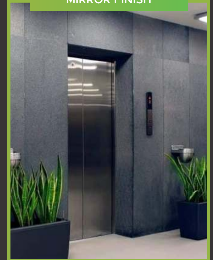
BLACK MIRROR FINISH