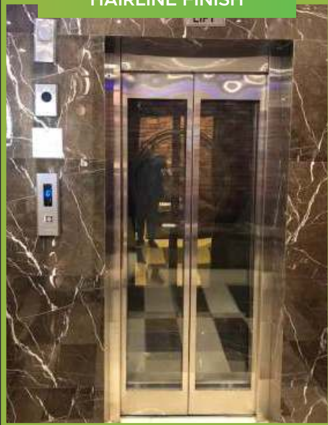
GLASS DOOR HAIRLINE FINISH